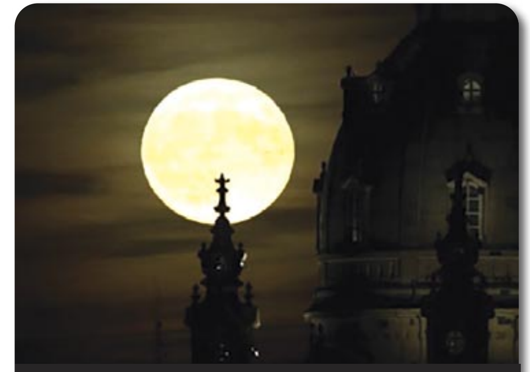
A "Strawberry Moon" rises behind Frauenkirche in Dresden, Germany (June 2022)